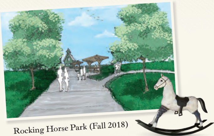
Rocking Horse Park (Fall 2018)